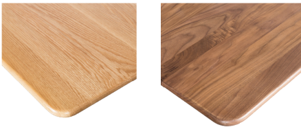
Solid American Oak

Wood is a natural material so each piece will be unique, telling a different story of the condition it grew in. There will be colour and grain variation.