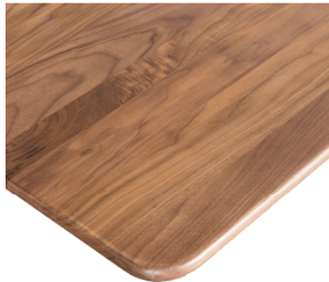
Solid American Walnut

Wood is a natural material so each piece will be unique, telling a different story of the condition it grew in. There will be colour and grain variation.