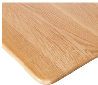
Solid American Oak

Wood is a natural material so each piece will be unique, telling a different story of the condition it grew in. There will be colour and grain variation.